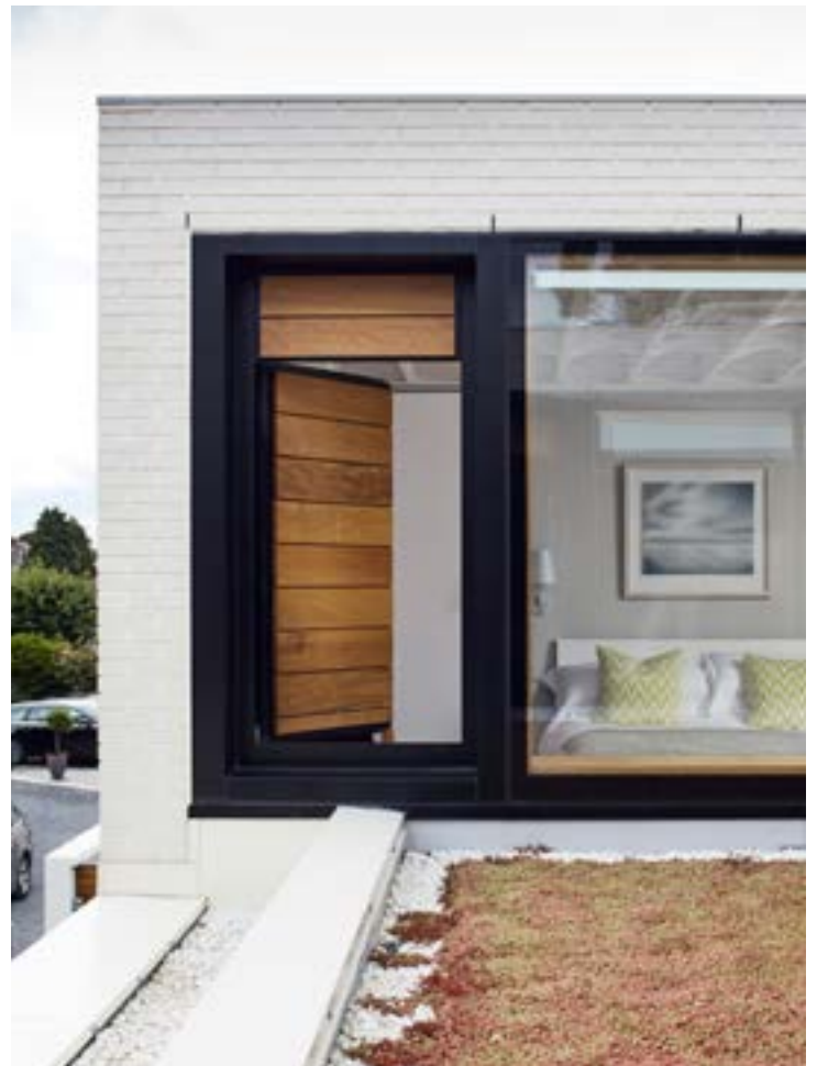
ABOVE LEFT The garden design by Allium Landscapes mirrors many of the home’s details including the iroko teak decking and built-in storage in the garden seat. ABOVE RIGHT The south-facing roof garden is planted with low-maintenance flowering sedum, which helps to slow rain fall off.