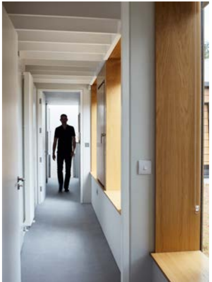
ABOVE LEFT Many of the stunning pieces of art were gifted to the couple. Moonlight (Bolus) by Eva McCauley sits at the bottom of the oak stairway. ABOVE RIGHT The 16-metre corridor that leads to the couple’s master bedroom is lined with built-in storage. The veneered oak windowsills offer seating for the children to look out over the courtyard.